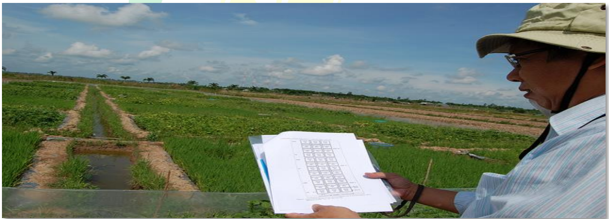
Fig: Measuring Greenhouse Gas Emissions from different Rice Systems in Vietnam

CSA invites to consider these three objectives together at different scales - from farm to landscape – at different levels - from local to global - and over short and long time horizons, taking into account national and local specificities and priorities.