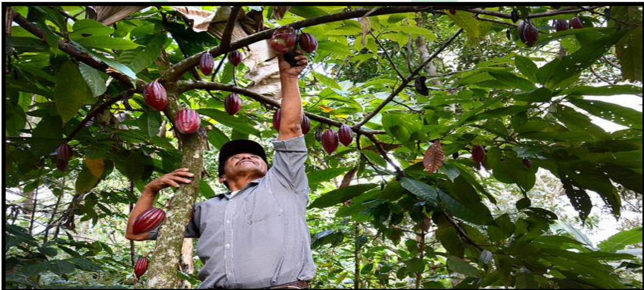
Fig: Farmers in Nicaragua Are Adopting Crops That More Adapted To Climate Change WHAT DEFINES CLIMATE-SMART AGRICULTURE?

The UN Food and Agriculture Organisation (FAO) estimate that feeding the world population will require a 60 percent increase in total agricultural production. With many of the resources needed for sustainable food security already stretched, the food security challenges are huge. At the same time climate change is already negatively impacting agricultural production globally and locally. Climate risks to cropping, livestock and fisheries are expected to increase in coming decades, particularly in low-income countries where adaptive capacity is weaker. Impacts on agriculture threaten both food security and agriculture's pivotal role in rural livelihoods and broad-based development. Also the agricultural sector, if emissions from land use change are also included, generates about one-quarter of global greenhouse gas emissions.