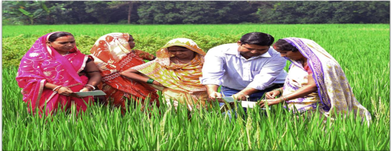
Fig: Farmers in a Climate-Smart Village In Bihar Use The Leaf Colour Chart To Judge The Nitrogen Content Required For Crops

opportunities for reducing or removing greenhouse gas emissions where feasible.